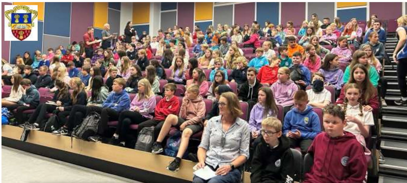
Assembly – 25.6.24

Here are some photos of our P7 pupils this week: