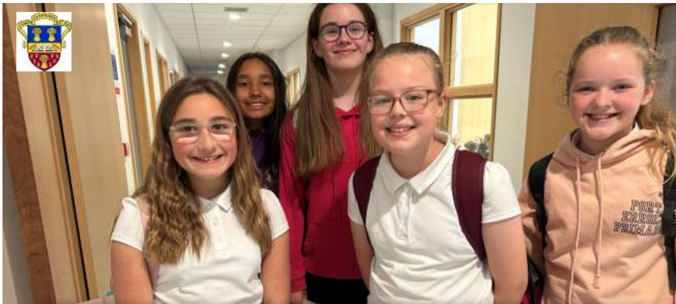
Break time – 25.6.24