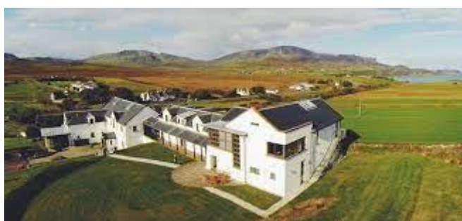
Columba 1400 Leadership Centre, Staffin, Isle of Skye