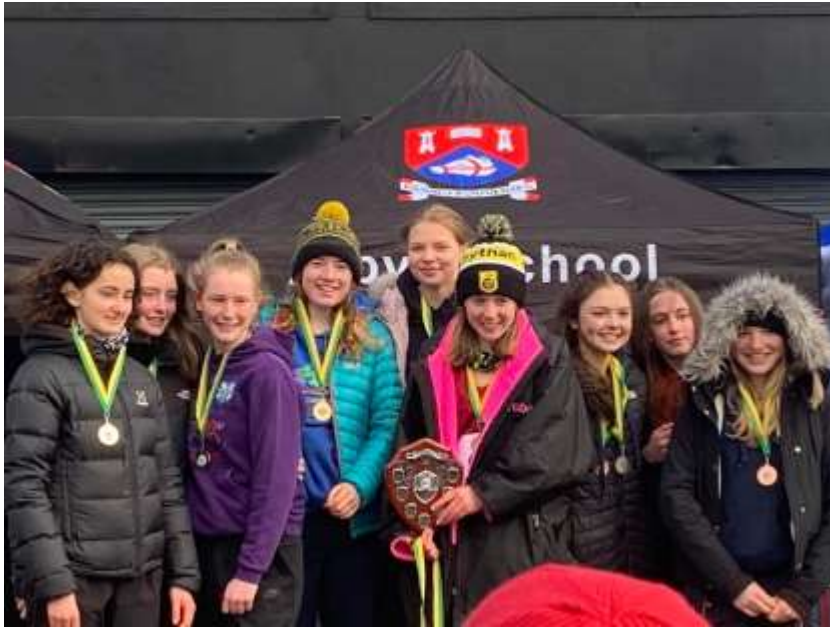
S2 boys Team who came 3rd in the Team event!